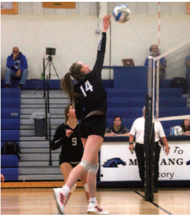
The Mustangs believe they can compete in a competitive region.

The South Border Volleyball team fell to visiting Edgeley on September 5 in Wishek, 25-18, 23-7, 25-15. Kaya Wiest had 5 aces in a losing effort. However the team bounced back in the Casselton Tournament on September 9, finishing first in their bracket.