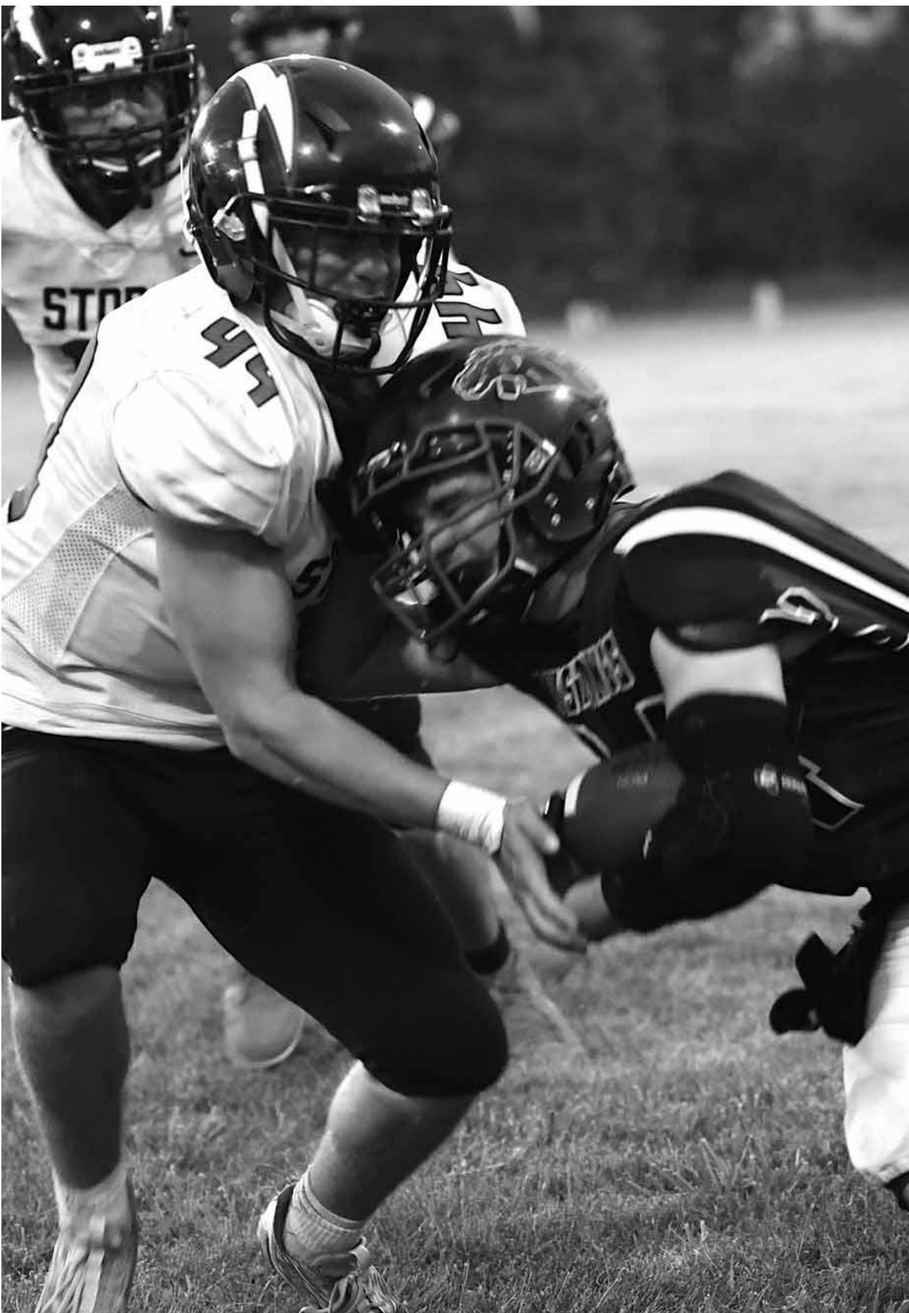
The Mustangs bulled their way to a win over their nemesis, Grant County, on Sept 1.